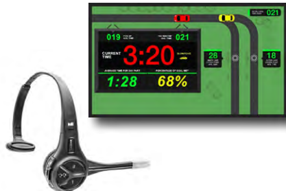
Drive-Thru Headsets & Timers

Pair with PAR's legendary hardware services to take tech off your plate.