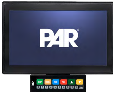
Kitchen Display System