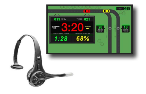
Drive-Thru Headsets & Timers