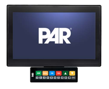
Kitchen Display System